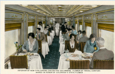
Interior of New Type of Dining Car on the Columbine.