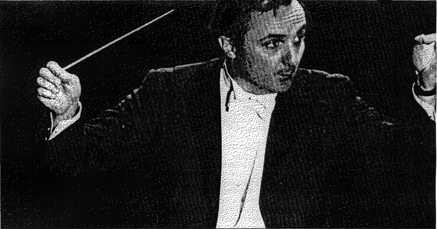
Photograph of Mario Bernardi

The mastery of any skill—whether a routine daily task or a highly refined talent—depends on the ability to perform it unconsciously with speed and accuracy while consciously carrying on other brain functions.