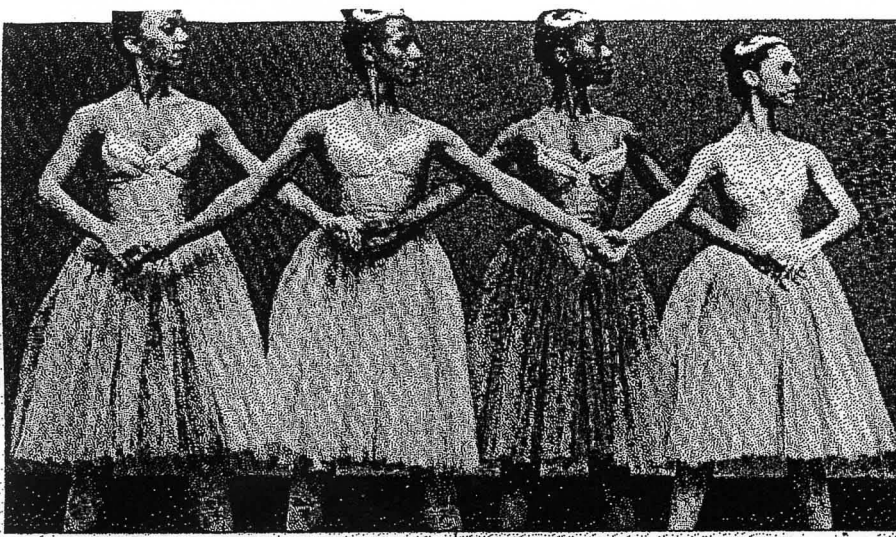
Photograph of Dance Theatre of Harlem by Marbeth, courtesy of Washington Performing Arts Society