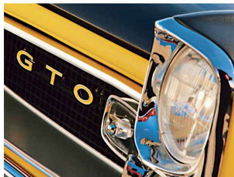
Getting To Outcomes "GTO"