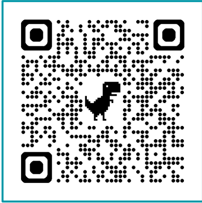
MHPA Webpage Link