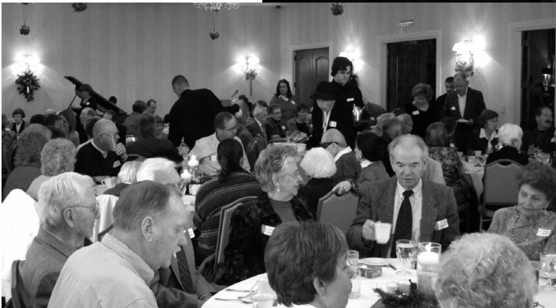
Volunteers enjoying brunch