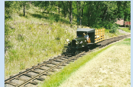
The Galloping Goose