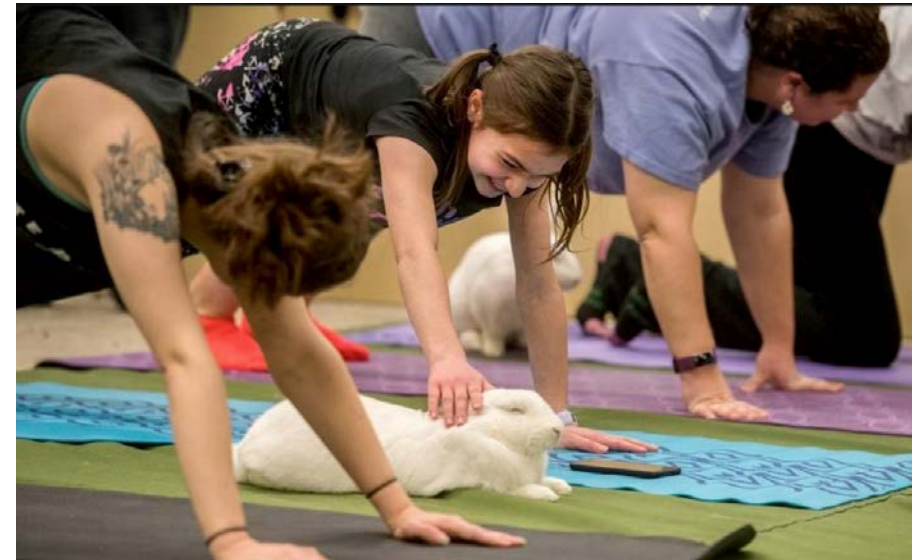
Pekin (IL) Public Library